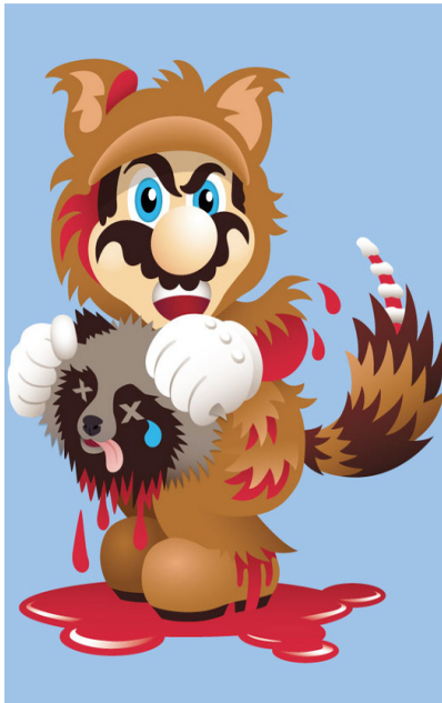
Now available: Super Tanooki Murderer 3! Return of the Murder!

example of the cruelty in Mario's games turtles or Koopas, as they are know in the mushroom kingdom, have been stomped on till they are forced into there shells. To add insult to injury most are then kicked to hurt or kill other animals. Worse yet when equipped with a fire flower Mario and the rest of his animal hating friends have burned alive countless many furry critters.